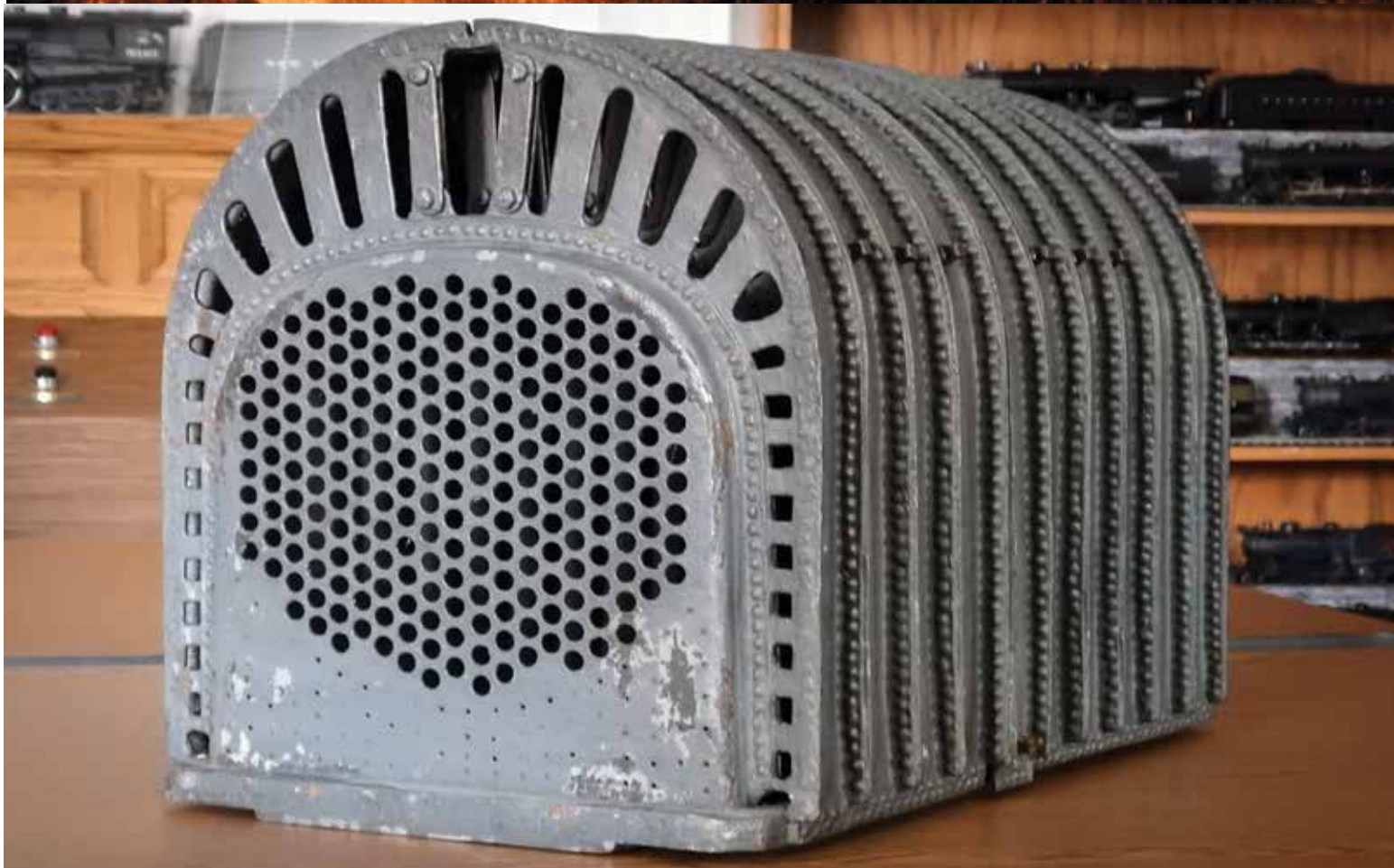
EXHIBIT SNEAK PEAK: THE TRANS-CONTINENTAL RAILROAD

NISHM is developing exciting projects in 2015- including two new seasonal exhibits featuring objects from our collection relating to the People, Process, and Product of the iron and steel industry.