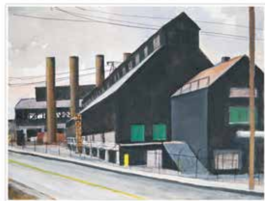
Open Hearth #1, 120 Mill and Stacks