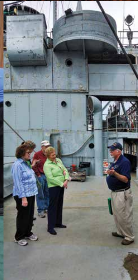
Members enjoy the 50th Anniversary of Hibernia Park Lecture and the trip to the S.S. John Brown in Baltimore.